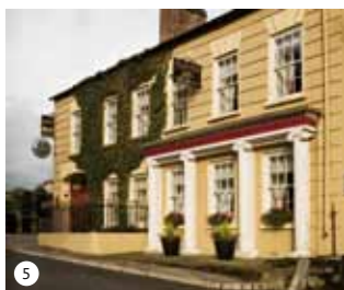
1 Carriage rides at Castle Leslie Estate 2 Cameo Hair 3 Glaslough Studio & Gallery 4 The Mallon Studio 5 Pillar House Hotel