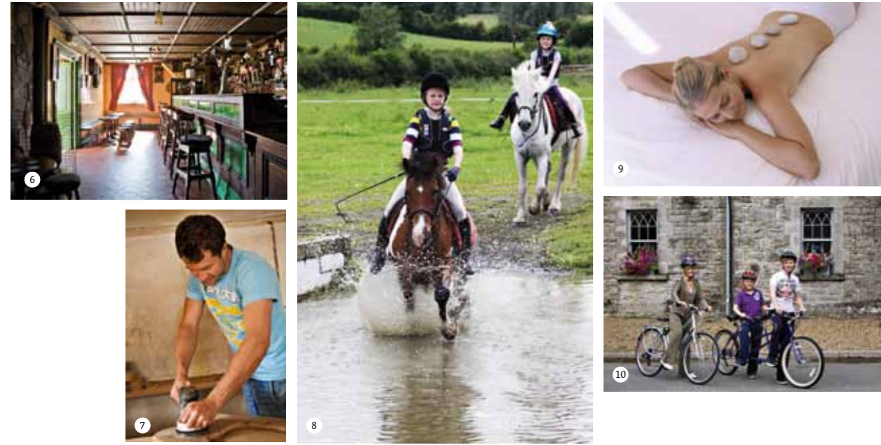
6 The Coachhouse & Olde Bar 9 Victorian Treatment Rooms 7 MK Woodcrafts 10 Paddy McQuaid Bike Hire 8 Cloncaw Equestrian Centre