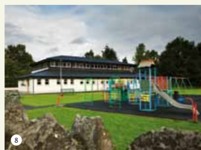
1 The Lodge at Castle Leslie Estate 2 The Mallon Studio 3 Way of Life 4 Glaslough Village 5 Dining at Castle Leslie Estate 6 Castle Leslie Equestrian Centre 7 Castlevue Antiques 8 Oakland Centre