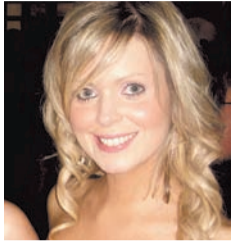
By Catherine Corr

Is it just me or has anyone else noticed that nowadays the word 'amazing' is used to describe, well, everything? I have to admit I'm guilty of using it myself. Without really thinking about what it means, I often find myself describing everything from food to clothes to locations as 'amazing' – I think I need to stop reading fashion magazines and listening to Radio 1.