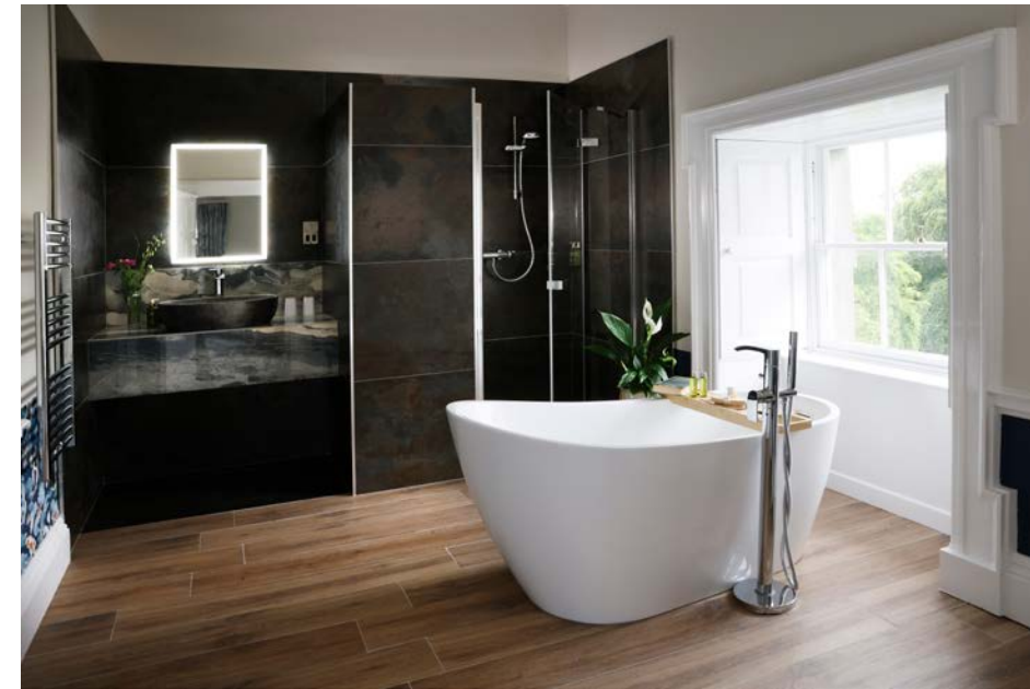
The ensuite bathroom in the School Room at Coopershill House is stylish with underfloor heating, a standalone bathtub, and a powerful large walk-in shower. The bathroom also has fantastic views to the south towards Keshcorran mountain and overlooking the River Unshin.