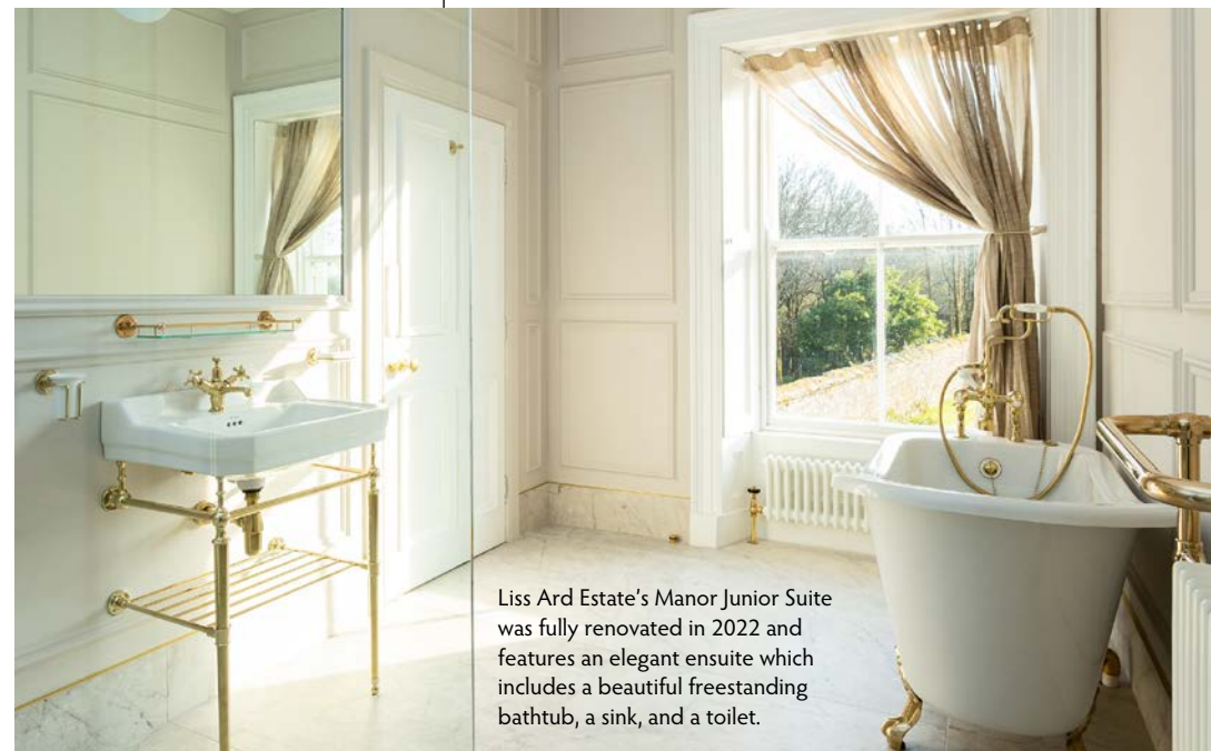
Liss Ard Estate's Manor Junior Suite was fully renovated in 2022 and features an elegant ensuite which includes a beautiful freestanding bathtub, a sink, and a toilet.

Nestled on 200 acres of Irish countryside dotted with beautiful woodlands, a private 50-acre glittering lake and James Turrell's renown Irish Sky Garden, Liss Ard Estate is a place of enchantment and relaxation. Situated just one mile from Skibbereen village in beautiful West Cork, it is full of character and personality, with a variety of accommodation to suit all tastes. Within this magnificent estate, they offer The Victorian Country House with its contemporary design, the adjacent Garden Mews and the Liss Ard Lake Lodge, a Victorian Dower house.