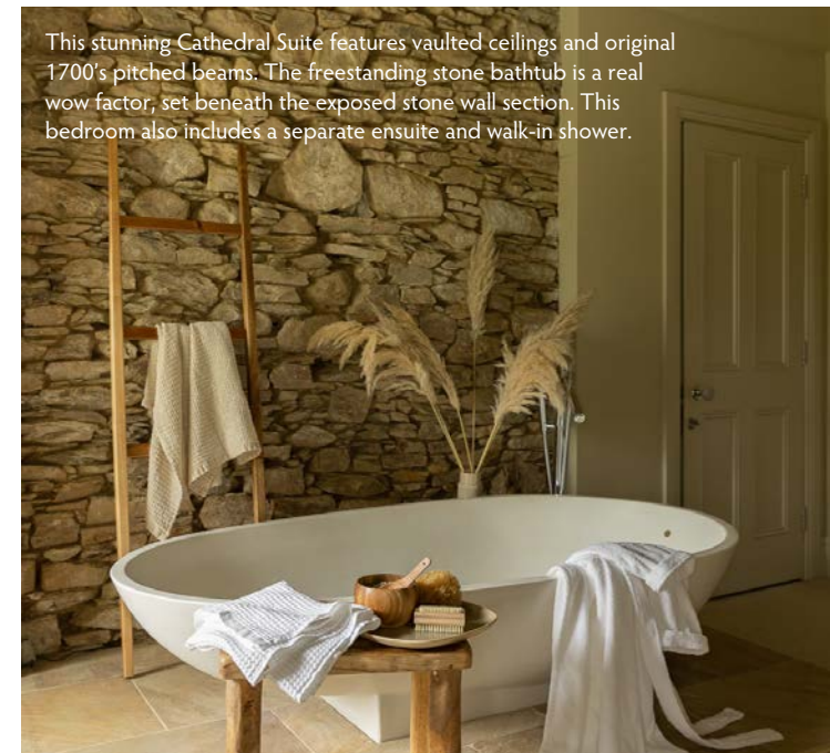
This stunning Cathedral Suite features vaulted ceilings and original 1700's pitched beams. The freestanding stone bathtub is a real wow factor, set beneath the exposed stone wall section. This bedroom also includes a separate ensuite and walk-in shower.

If you are looking for a genuine, romantic, grand Irish country house with comfort, character, and sublime cooking, then you are going to love Coopershill in Co. Sligo. Warm hospitality, original antiques, spacious bedrooms, bathrooms, and views from every window create an oasis of peace, quiet and relaxation. Located by the Wild Atlantic Way, it's the perfect base for exploring WB Yeats country, mountains, lakes, and megalithic ruins along with championship golf courses, beaches, and fishing just a short drive away.