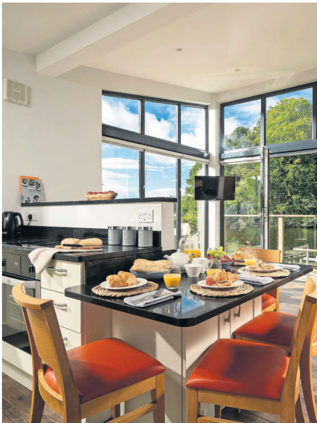
KILLYHEVLIN LAKESIDE LODGES AND HOTEL

There's good reason why Meath is known as the Royal County, thanks to its wealth of attractions, including Newgrange, the Hill of Tara and Slane Castle. This four-star resort on the edge of Trim offers family packages, which include all-access passes to the popular theme park and zoo Emerald Park, a 25-minute drive east. Trim, Co Meath ( knightsbrook.com )