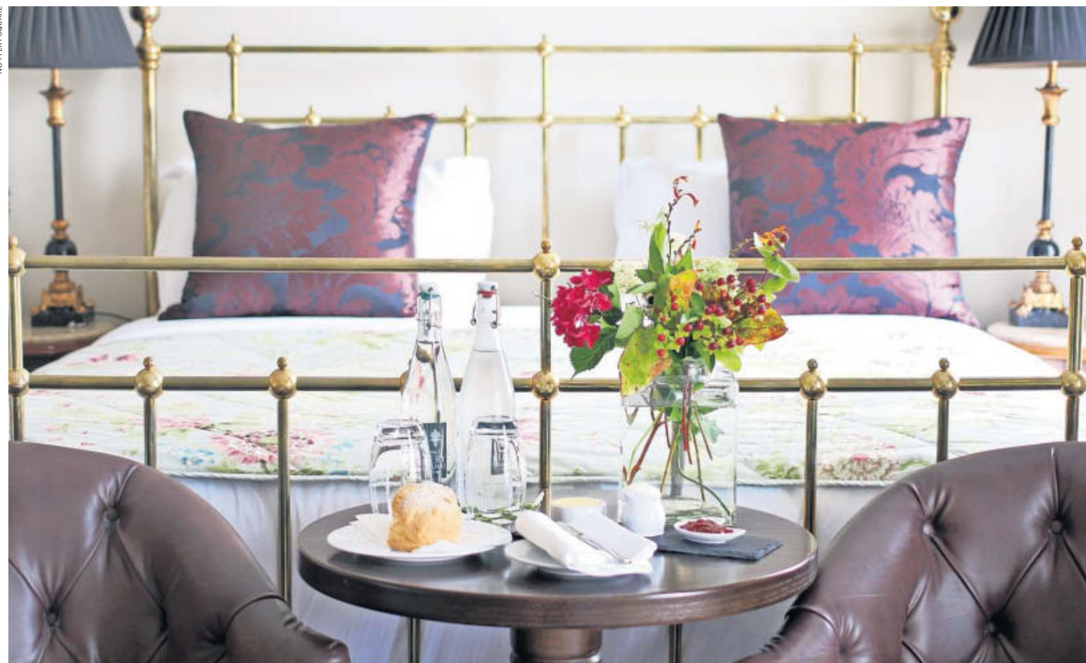
NO 1 PERY SQUARE

Bijou is too expansive a term for this two-bedroom speck in almost 70 acres of Mount Congreve Gardens. But plenty of grandeur is packed into its diminutive proportions. The decor weaves together the historic and contemporary in a captivating mix – from original Louis XVI beds and antique furniture to Smeg appliances and a Frame TV. Enjoy the "keys to the gardens" and hop on an Elops hybrid bike, or lounge on the hammock in the secluded terrace for ultimate peace and quiet. Kilmeaden, Co Waterford (mountcongreve.com)